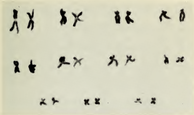
FIG. 2. Karyotype of Leptodactylus chaquensis , specimen WRH 1402.